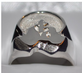
St. Anthony Catholic High School Halo Ring